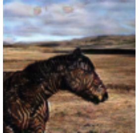
P_{0.5}(w) \rightarrow Q_{12}(w, f)