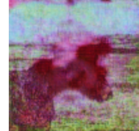
P_{0.5}(w) \rightarrow Q_8(w, f)